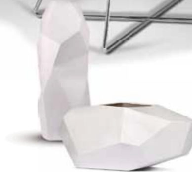
Origami ceramic vases