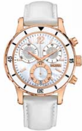
Balmain Collection for women / Balmina, 5 742 NIS (get at EuroAsia shoop)