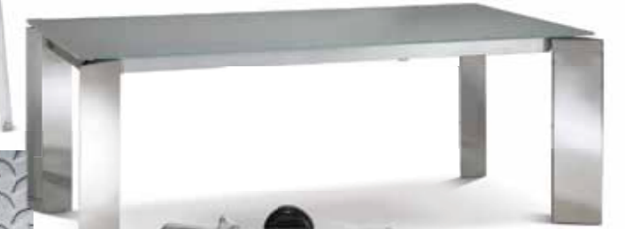
Alete dining table – stainless steel and shatterproof glass