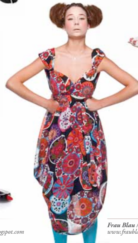
Frau Blau / www.fraublau.com