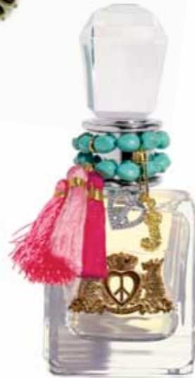
JUICY COUTURE / Peace Love & Juicy Couture for women, 500 NIS