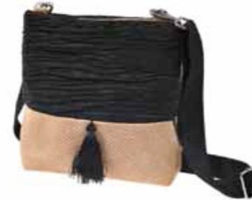
Rachel Shabar / Atena, textile & skin, 950 NIS