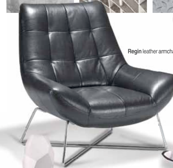
Regin leather armchair