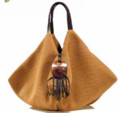
Rachel Shabar / Artemis, textile, 850 NIS