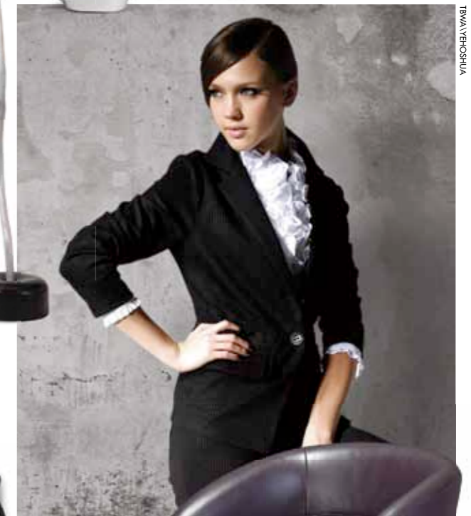
Laura leather chair