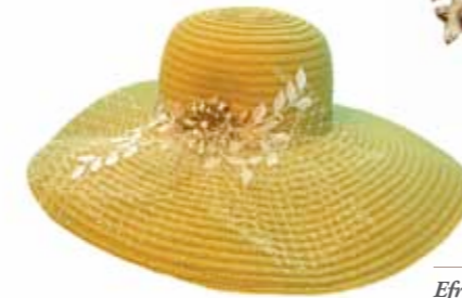
Efrat Cassouto / Orange straw hat, 460 NIS www.efratcassouto.co.il