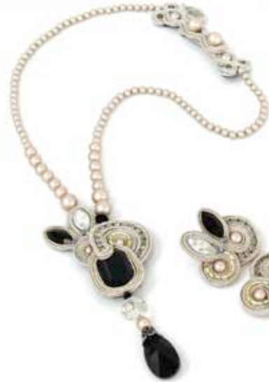
Dori Csengeri / Désirée Collection, Spring-Summer 2011, necklace 990 NIS, clip earrings, 580 NIS

Dori Csengeri 242 Dizengoff Street, Tel Aviv Tel.: +972 3 6043273 www.DoriCsengeri.com