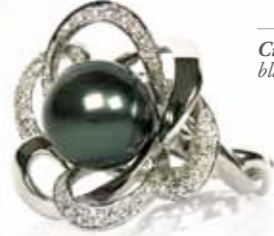
Citra / Citra Jewelry collection, black pearl, www.pearls.co.il