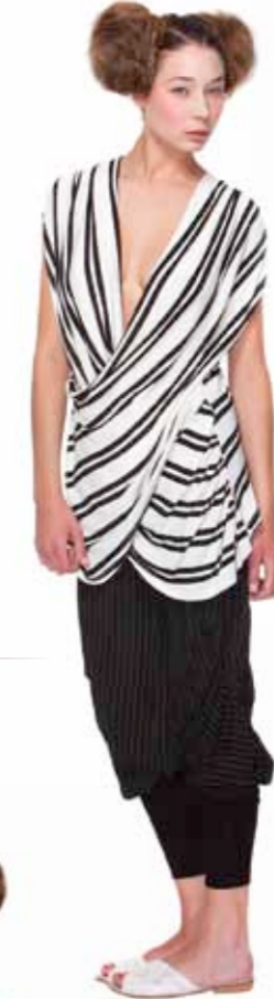
Frau Blau / www.fraublau.com