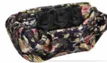
Rachel Shabar / Goya, satin & plicce, 1200 NIS