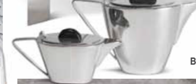
Brassco silver plated tea pots