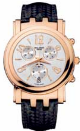
Balmain Collection for man / Madrigal, 4 176 NIS (get at EuroAsia shoop)