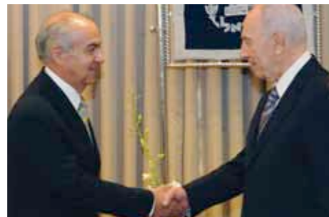
Ambassador of Cyprus H.E. Dimitris HATZIARGYROU