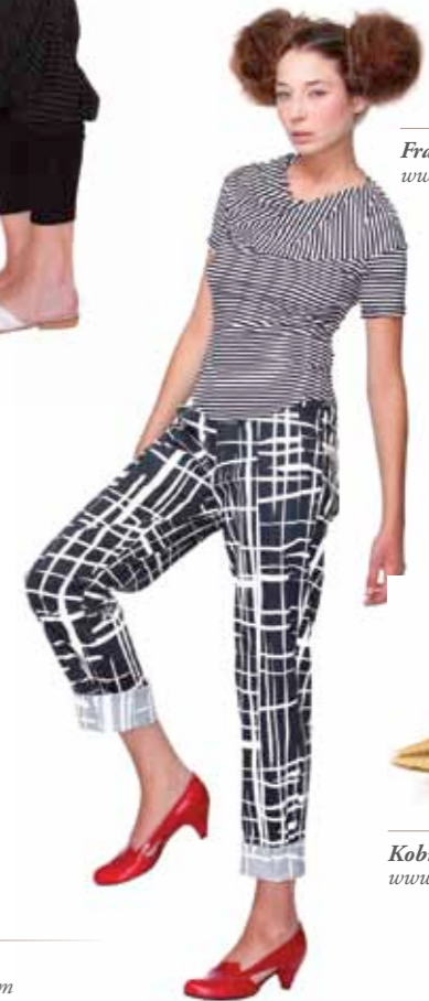
Frau Blau / www.fraublau.com