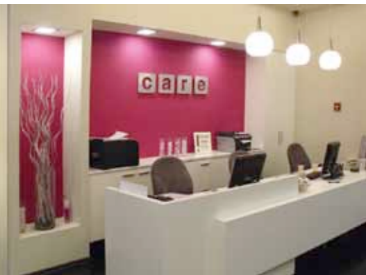
Care Medical Services / www.care.co.il