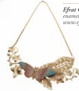
Efrat Cassouto / Butterfly enamel neckles, 520 NIS www.efratcassouto.co.il