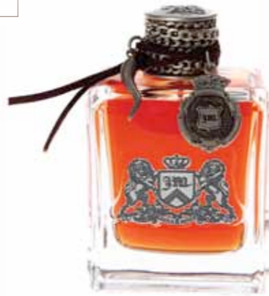
DIRTY ENGLISH / for man, 500 NIS