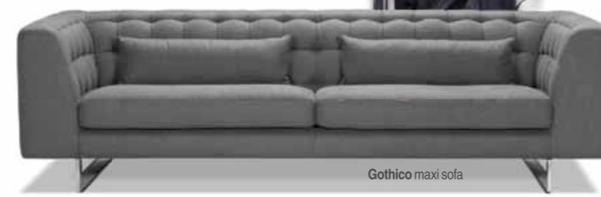
Gothico maxi sofa

Free design consultancy | NEW - design your floor - designed rugs and parquet in an exclusive collection | www.iddesign.co.il | *6610