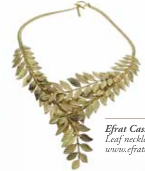
Efrat Cassouto / Leaf neckles, 750 NIS www.efratcassouto.co.il