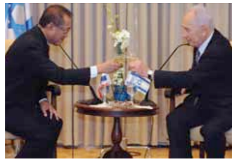
Ambassador of Thailand H.E. Nuttavudh PHOTISARO