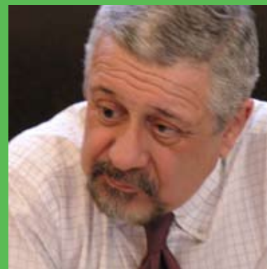
Uruguay ambassador Alfredo Cazes Alvarez

A few kilometers north of Beersheva, a platform adorned with the flags of dozens of nations awaited the participants on the tour for Diplomats. Visible in the background were low dams along Nahal Karkur, where a few dozens trees had been planted, in anticipation of the thousands that will follow. Foreign Minister Silvan