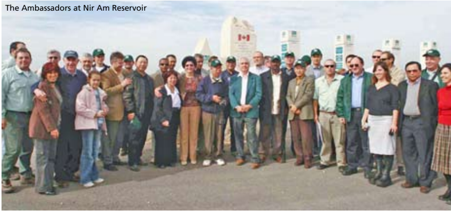
The Ambassadors at Nir Am Reservoir

the country. Thank you for allowing us to belong to this venture."