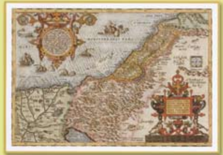
Original Map of the Holy Land by Ortelius-1585