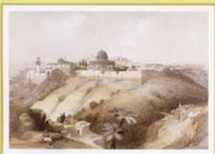
Original Lithograph by David Roberts-1841

Large selection of prints by Roberts, Bartlett, Allom, Turner, Finden and many others.