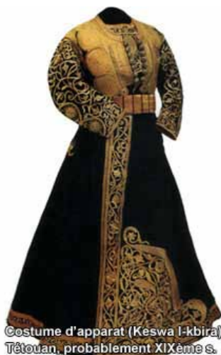
Costume d'apparat (Keswa l-kbira) Tétouan, probablement XIXème s.

Jewish museum assembles mixture of objects that attest to rich history of Morocco's 2,000-year-old Jewish community.