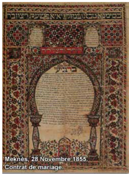
Meknès, 28 Novembre 1855. Contrat de mariage.

Still, such sentiments are not universal. A police officer stands watch in front of the museum - testament that this institution celebrating Jewish culture does not please everyone. The museum's website is http://casajewish-museum.com/ .