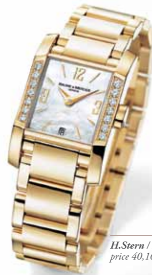
H.Stern / Baume & Mercier, price 40,163 NIS