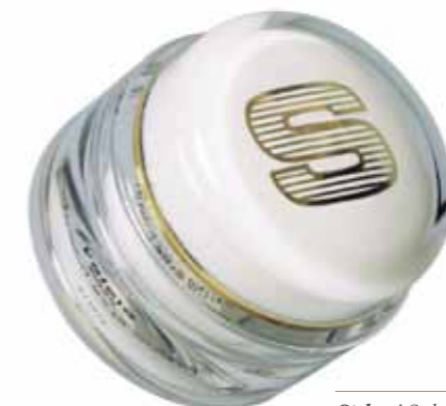
Sisley / Sisleya Global Anti-Age