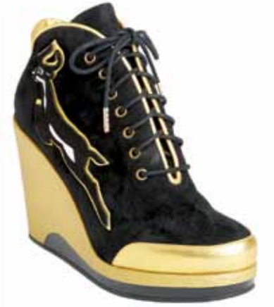
Marc by Marc Jacobs / Factory 54, price 2,990 NIS