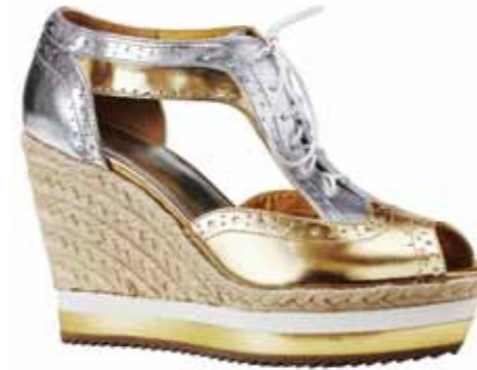
H&M / Price 249 NIS