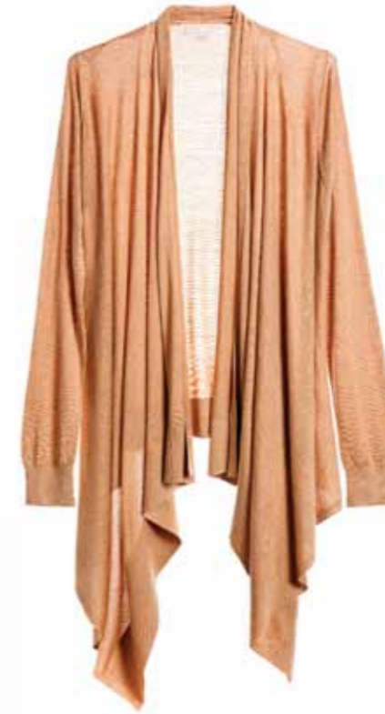
Michael Kors / Factory 54, price 1,490 NIS