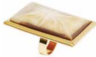
H&M / Price 49.9 NIS