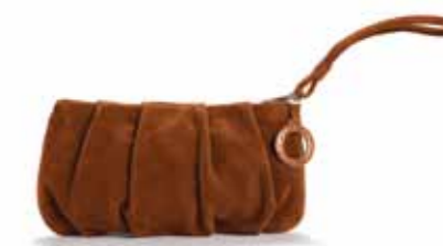
Emporio Armani / Factory54

The colorful and turbulent 1970's were the years of war and dreams of peace, years of pure escapism from reality that was reflected in the form of free love and lots of music like pop, rock and especially - disco. The sparkling disco balls and big Afro hairdos spawned various party trends that include surprising color combinations, psychedelic prints and geometric shapes. This season they come back to us as flares, short A-shaped dresses and wide cloaks in unusual combinations of colors: blue, mustard, burgundy, green or purple.