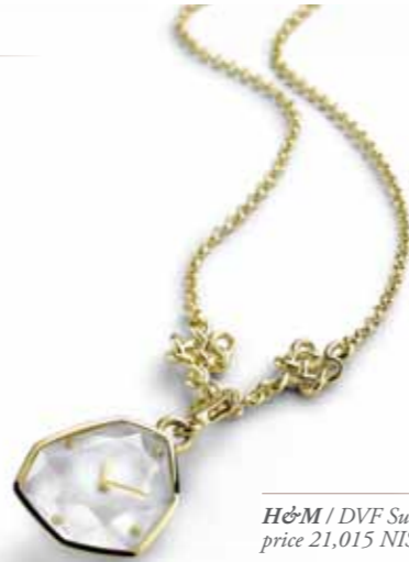
H&M / DVF Sutra Pendant Swatch, price 21,015 NIS