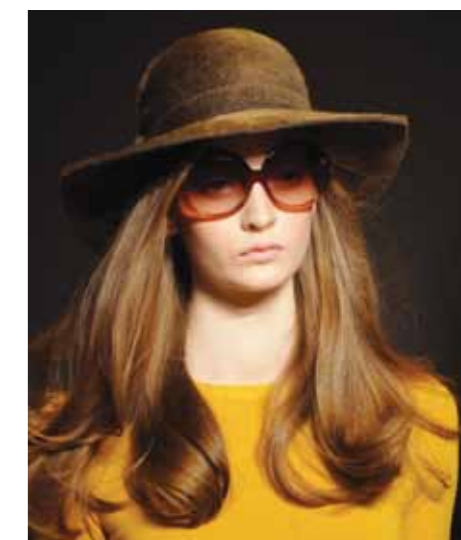
Marc by Marc Jacobs / Factory54