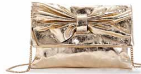
Red Valentine / Factory 54, price 2,490 NIS