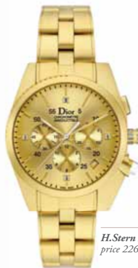
H.Stern / Dior Swatch, price 226,200 NIS