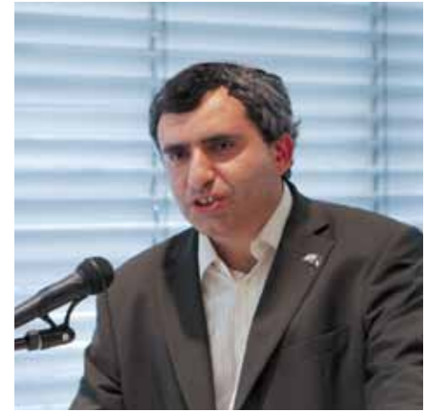
Mr. Zeev Elkin

The speakers addressed the latest developments in the Palestinian Authority and expressed hope that the upcoming year will be a year of peace and collaboration between the two neighboring nations. Mr. Zeev Elkin thanked the diplomats for the continued support that their countries give Israel and wished the guests a sweet and happy new year.