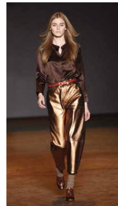
Marc by Marc Jacobs / Factory54

The metallic trend this season is reflected through complementary opposites - bright and cool colors embraced by the warm winter palette. On the one hand, it has Renaissance touches: the pants, jackets and skirts of leather or wool, with a glossy finish, clean cut and of silver, bronze or copper colors, are styled with a chiseled look. Such items remind of the richness and uniqueness of that period, when arts and aesthetics had flourished. On the other hand, the metallic look also makes its appearance in flowing and shiny satin and silk in bright modern colors, such as light shades of brown, gold, purple, lilac or turquoise in soft feminine shapes.