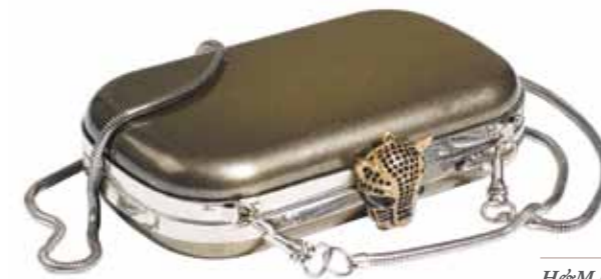
H&M / Price 299 NIS