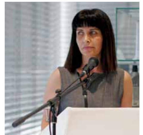
Dr. Einat Wilf

The event ended with a drawing for a weekend at the luxurious Tamarin Boutique Hotel in Rosh Pina, 100$ coupons in the Diplomat Store Duty Free and other prizes.