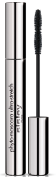
Sisley / Phyto mascara ultra stretch