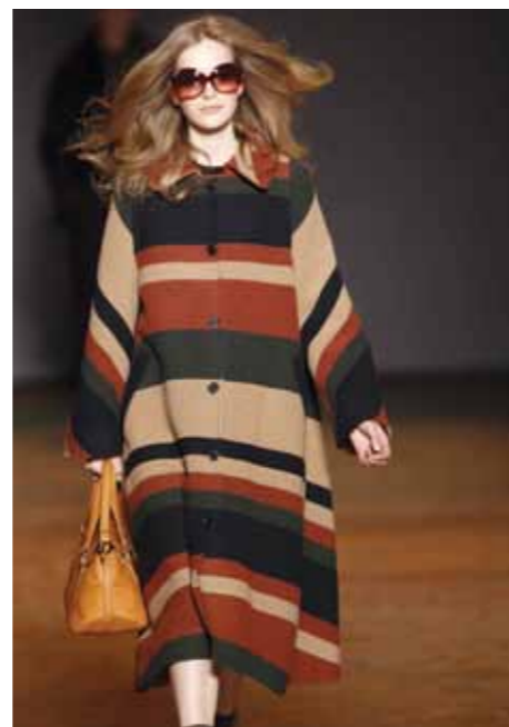
Marc by Marc Jacobs / Factory54