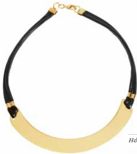
H&M / Price 49.9 NIS