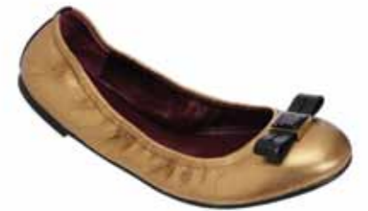
Marc by Marc Jacobs / Factory 54, price 1,690 NIS