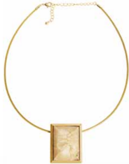
H&M / Price 59.9 NIS