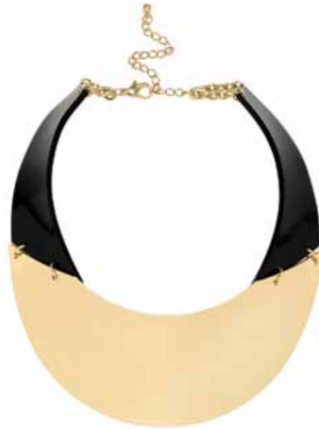
H&M / Price 59.9 NIS